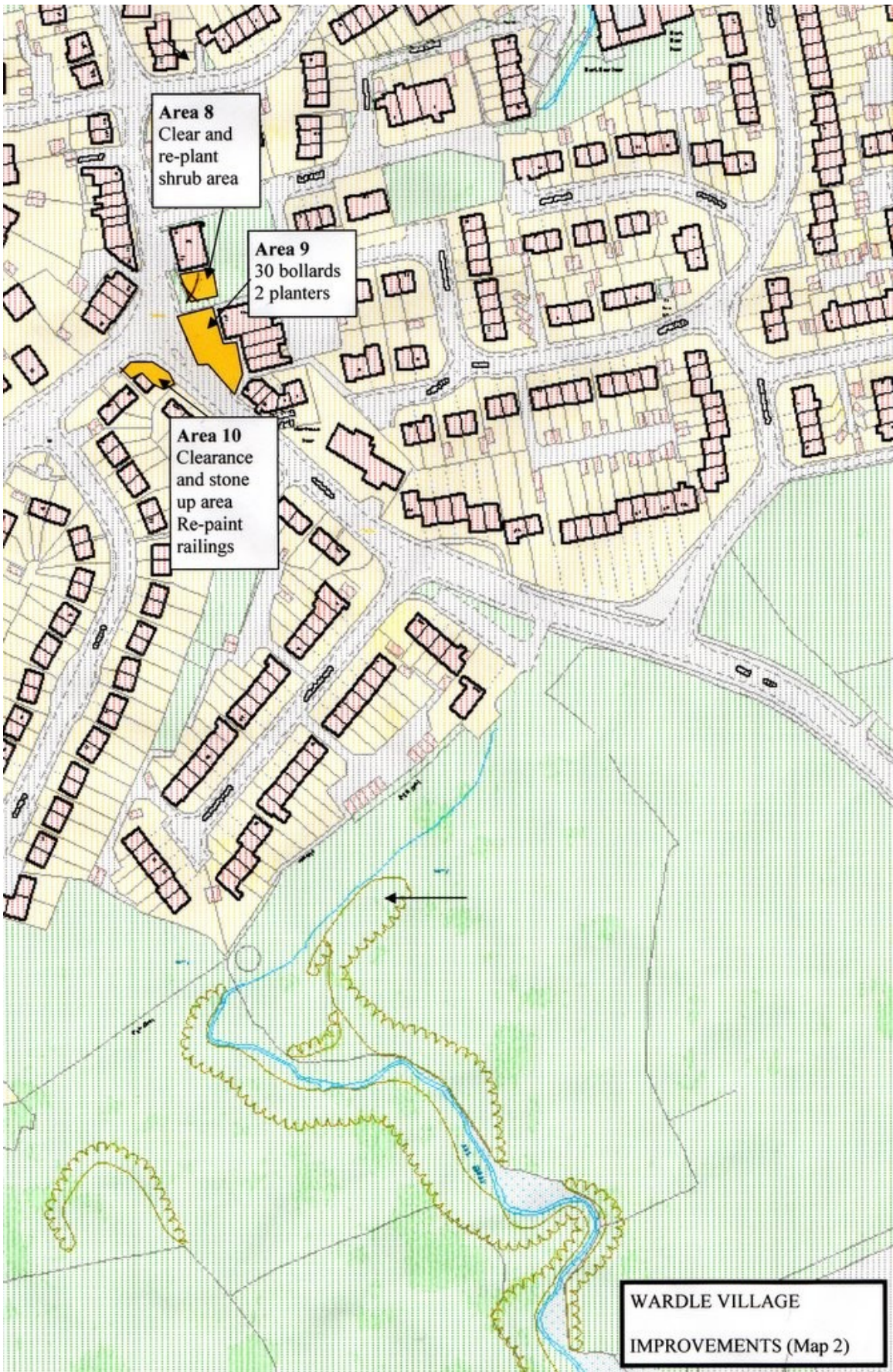
WARDLE VILLAGE IMPROVEMENTS (Map 2)